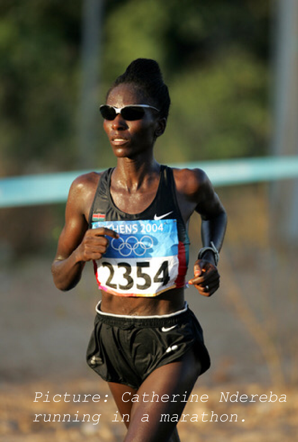
running in a marathon.